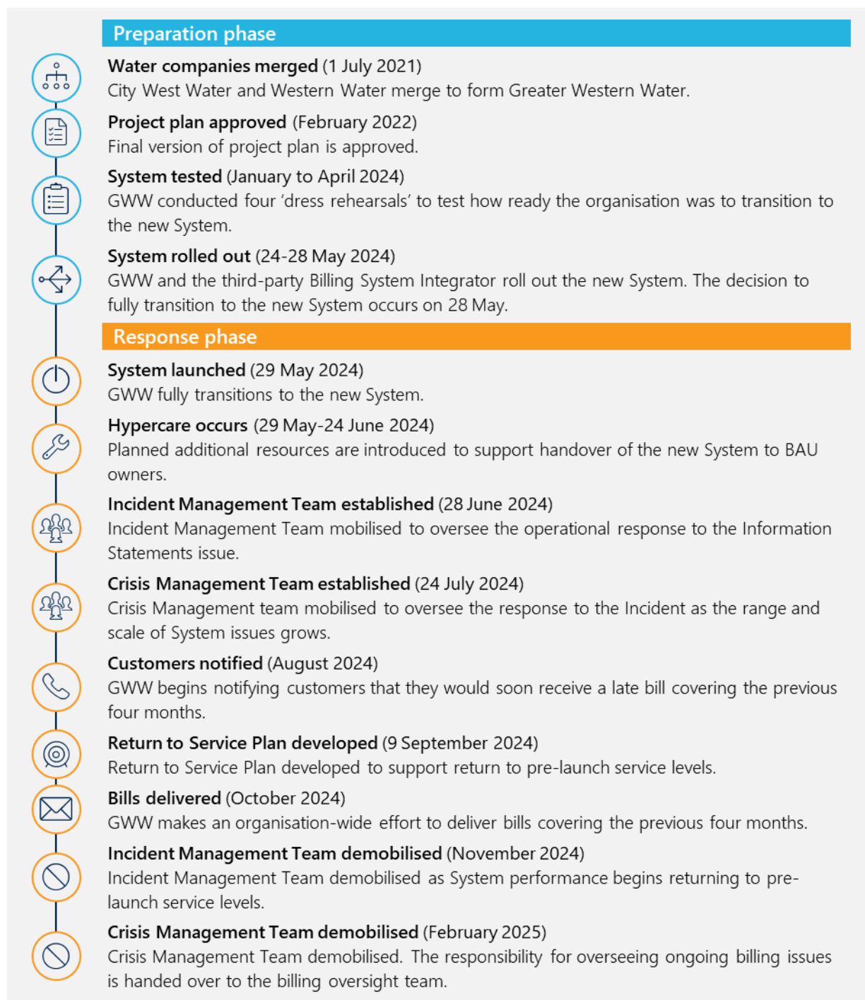
Figure 1 | Timeline of the Incident

This section provides a timeline of the Incident. Figure 1 summarises some of the planning activities that GWW delivered before launch, as well as the actions that GWW took to respond to the issues that arose after launch. The Review considers the preparation phase as the period leading up to System launch on 29 May 2024, and the response phase as the period after launch and up to February 2025, when the Review started.