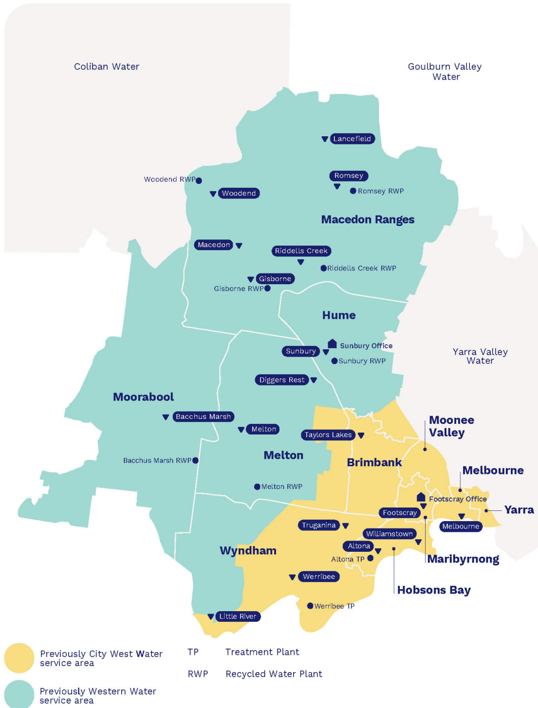
Figure 1-1: Greater Western Water’s service area (consisting of historical City West Water and Western Water service areas)